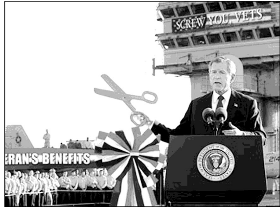
Shameless: He'll use soldiers for photo ops, but Bush's agenda apparently does not include meaningful benefits for veterans.

We as veterans along with all members of our community cannot let this happen! Please call or write the following representatives, asking them to urge the U.S. Department of